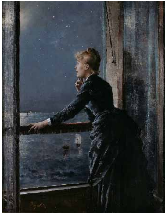
Fig. 323.1 Alfred Stevens, The Milky Way (La voie lactée) , c. 1884–86. Oil on canvas, 67.7 x 52.7 cm. Private collection

A young woman, lavishly dressed in an evening gown adorned with French jet or something similar, and with a scarf around her neck, stands at an open window, looking out over the sea, her right hand resting on the padded upper rail of a decorative metal railing. It is night, the sky is spangled with stars, and the moon can be seen at the left edge of the picture, its cool light illuminating the woman's face. The sea is enlivened by sailing boats and one small dark steamship, but the shoreline is not visible; nothing comes between the woman at her window and the vast space outside. She might have just risen from the chair behind her; as she turns her face to the moonlight, she seems absorbed in contemplating the spectacle before her, but, beyond this, there is no suggestion of the nature of her emotions in front of the scene.