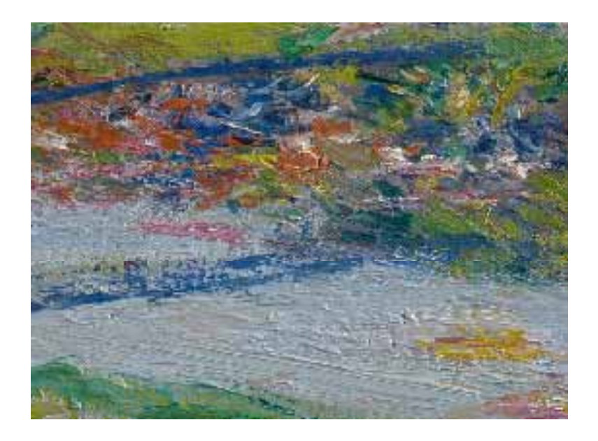
Fig. 227.1. Detail from the lower left of Tulip Fields at Sassenheim

To cope with the challenges of the terrain, Monet opted for two pictorial strategies. In all five cases, he broke the monotony of the horizon by introducing