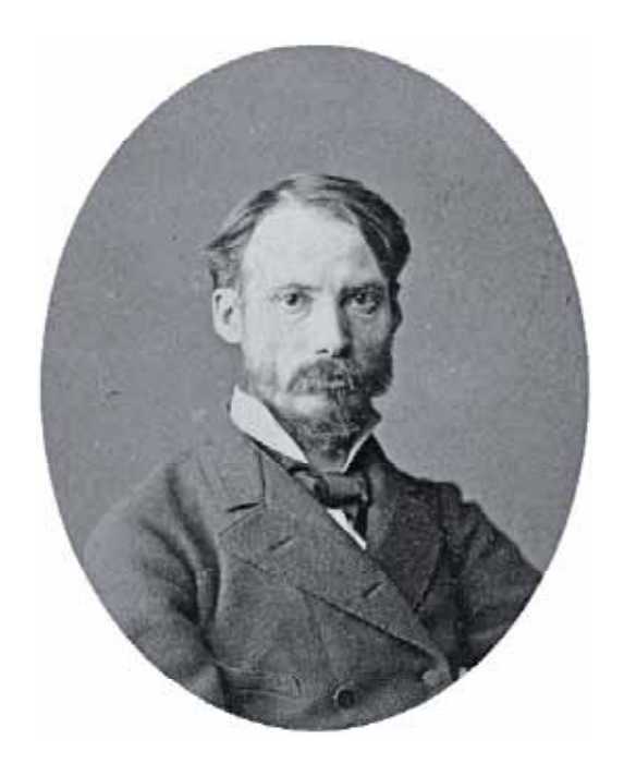
Fig. 266.1. Artist unknown, Pierre-Auguste Renoir , c. 1875. Photograph. Musée d'Orsay, Paris (inv. OD 102)

ters; it would have stood out from the other portraits of men that he exhibited in 1876, notably his canvas depicting Monet at work, holding his palette (Musée d'Orsay, Paris), and is very unlike his roughly contemporary portrait of Alphonse Fournaise (cat. 264). In some ways, in this one canvas Renoir's treatment of his own face comes closer to Paul Cézanne's late selfportraits, which evoke the intensity of the painter's vision quite without self-adornment (for example, those in the Musée d'Orsay, Paris; and The Phillips Collection, Washington). Self-Portrait is also conspicuously unlike another canvas that Renoir painted around the same date that has come to be considered a self-portrait (1876; Harvard Art Museums / Fogg Museum, Cambridge, Mass.). In this unfinished painting, depicting an artist seemingly holding his brushes as he turns to look at the viewer, the sitter's facial features are much softer, his eyes larger, and the brushwork far smoother and more supple. This canvas was not recognized as a self-portrait in Renoir's lifetime, and it remains very possible that it represents one of his friends. 5 Comparison with a contemporary photograph of the artist (fig. 266.1) confirms the verisimilitude of the present painting, and casts further doubt on the identity of the sitter in the Fogg canvas. JH