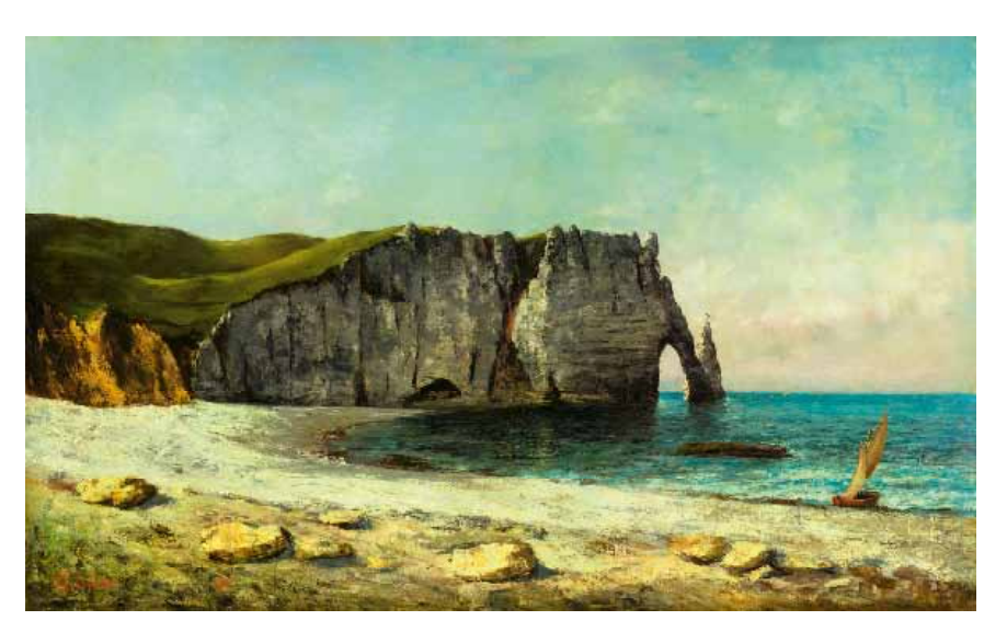
Fig. 226.1. Gustave Courbet (French, 1819–1877), Cliff at Étretat , 1869. Oil on canvas, 76.2 x 123.1 cm. The Barber Institute of Fine Arts, University of Birmingham, England

at my inability to express it all better."<sup>11</sup> Some of these rare, bright interludes occurred in late October and early November, and it was perhaps then that Cliffs at Étretat was begun. He had been waiting anxiously for the fishing fleet to put to sea and on 30 October was able to announce how "admirable" the event was, anticipating a number of sketches of the sight.<sup>12</sup> Easily mistaken for pleasure craft, this flotilla with its distant russet sails does much to emphasize the scale of the cliff-scape in the Clark scene, while coincidentally suggesting a more precise date for its execution.